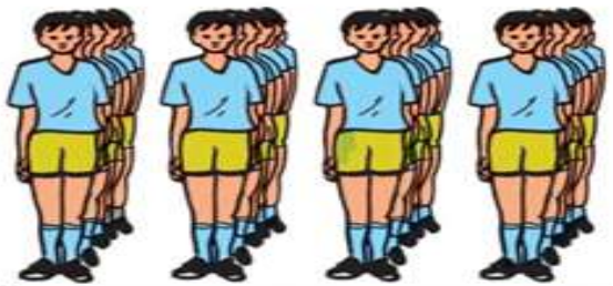
लाइनमा सँगै उभिऔँ ।