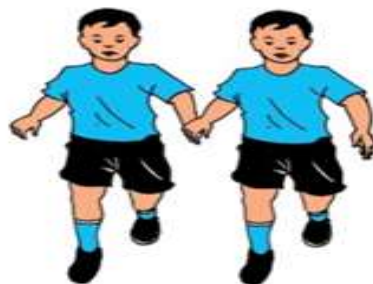
लाइनमा सँगसँगै हिँडौँ ।