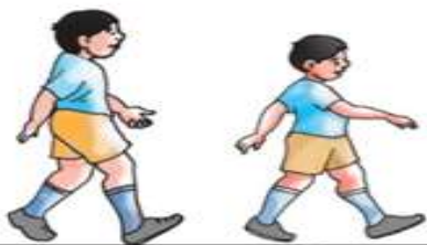
लाइनमा अघिपछि हिँडौँ ।